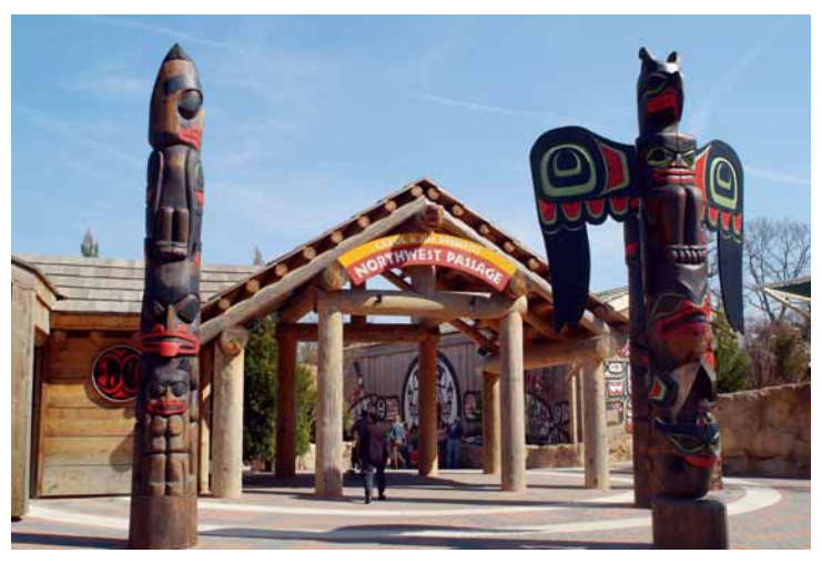
The entrance complex to Northwest Passage

Today, the Memphis Zoo stands as a crown jewel for the city. It is Memphis's highest attended attraction and is ranked the top zoo in the country by two independent surveys. The Zoo's conservation programs circle the globe – from cooperative programs in China for giant pandas to local efforts to save the Louisiana pine snake. More than 90,000 children see the Zoo on annual field trips and more than 100,000 people visit on free admission every year.